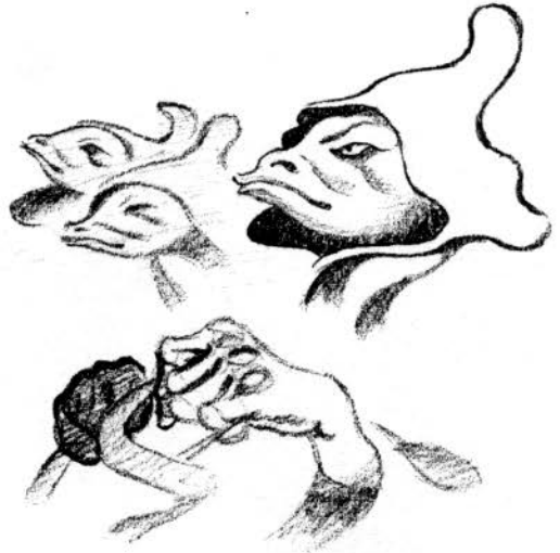
"The Three Green Archers from Khest"